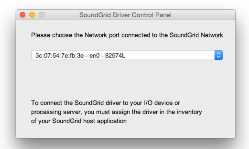
Mac – SoundGrid Core Audio Driver Control Panel