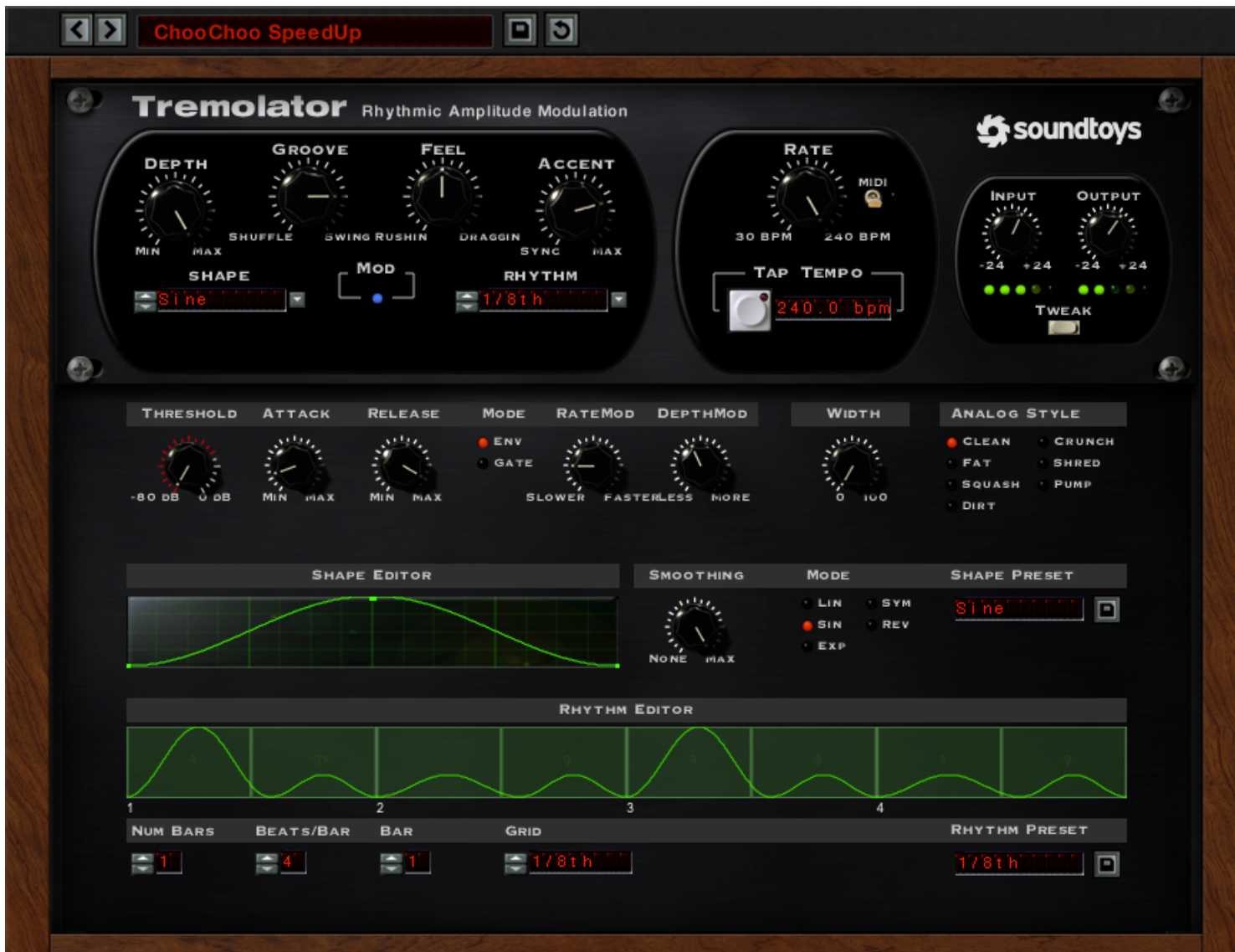
Figure 1: Tremolator's Control Panel and Tweak Menu