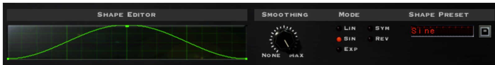
Figure 5: Tremolator's Shape Editor Section