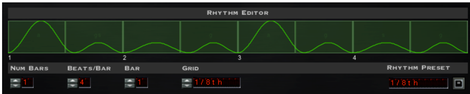
Figure 7: Tremolator's Rhythm Editor Section