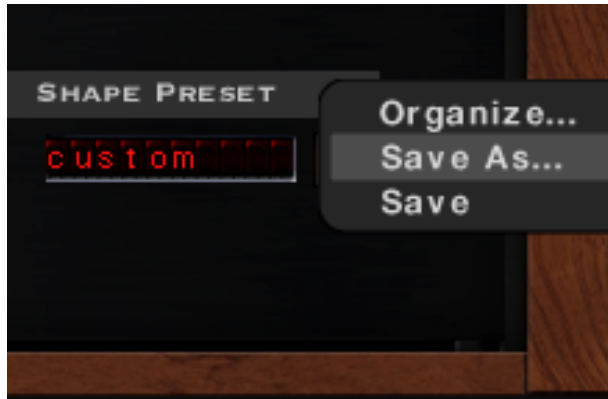
Figure 6: Saving a new Shape Preset