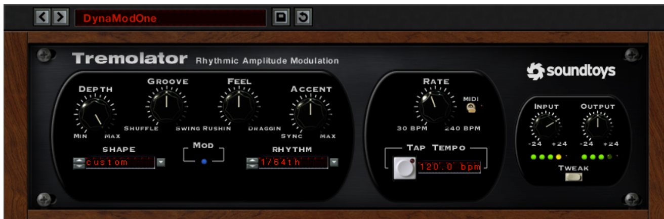
Figure 2: The Tremolator Control Panel