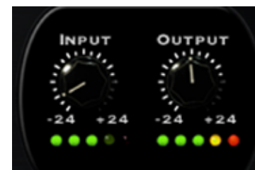
Figure 3: Output LED indicating maximum signal level

These controls are particularly useful in allowing you to control the amount of saturation and distortion present in Tremolator.