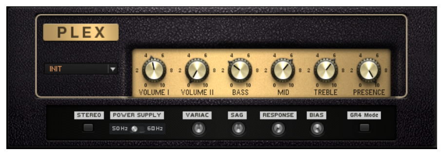
The GR4 Mode switch in the lower right of the PLEX component.

A GR4 Mode switch was added to the following components: Tweedman , Lead800 , Plex and Bass Amp Pro in order to improve backward compatibility of some Presets.