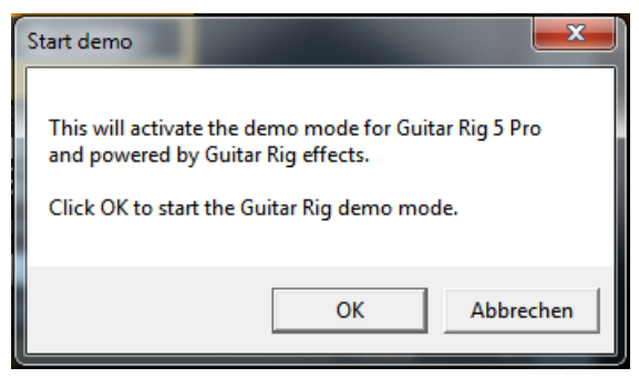
The Demo mode starting dialog.

Whenever you drag and drop a demo component into the Rack, GUITAR RIG will ask you whether to start Demo mode or not.