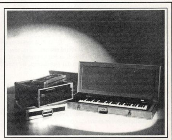
Shown: 4-space rack with EPS-16 PLUS module, 2-space rack, Eagle-I VFX-sd case

8:00 am to 4:30 pm CT, Mon. - Fri. We accept: COD, Visa, Mastercard, American Express.