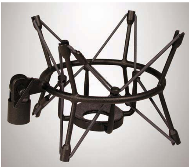
SM-1 Shock Mount